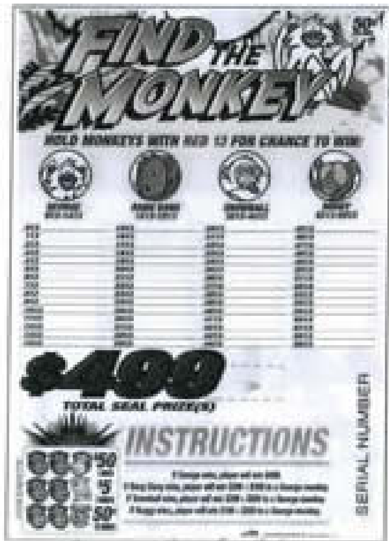
Seal Card Open