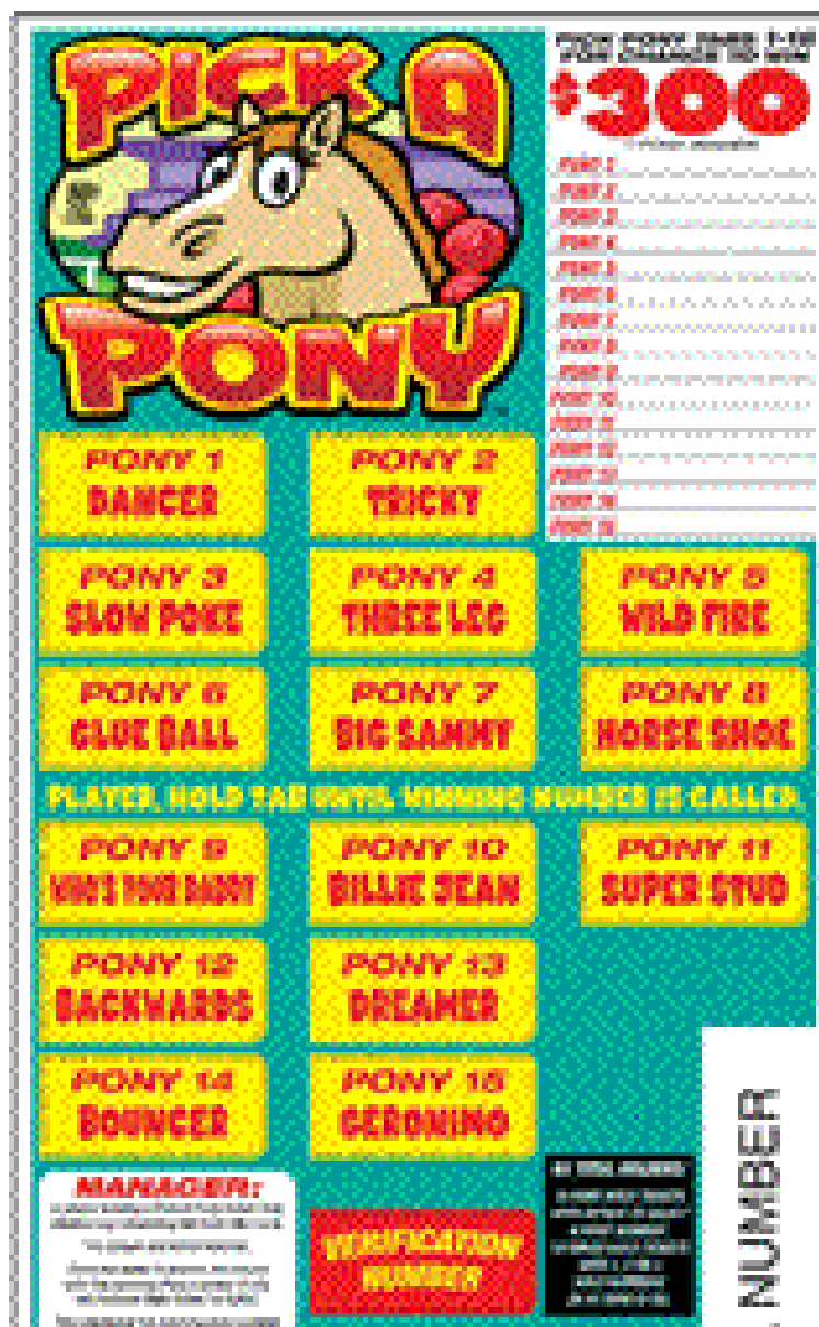
Bingo Card (Closed)